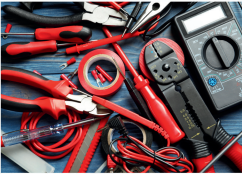
Ele . instruments