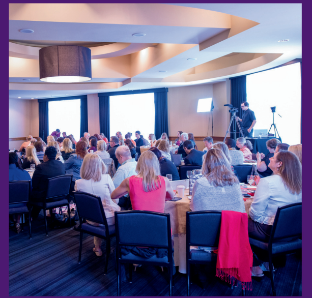
Industrial Corporate Training Centre