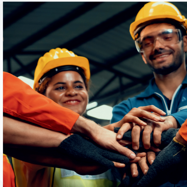
Skills Engineer Course