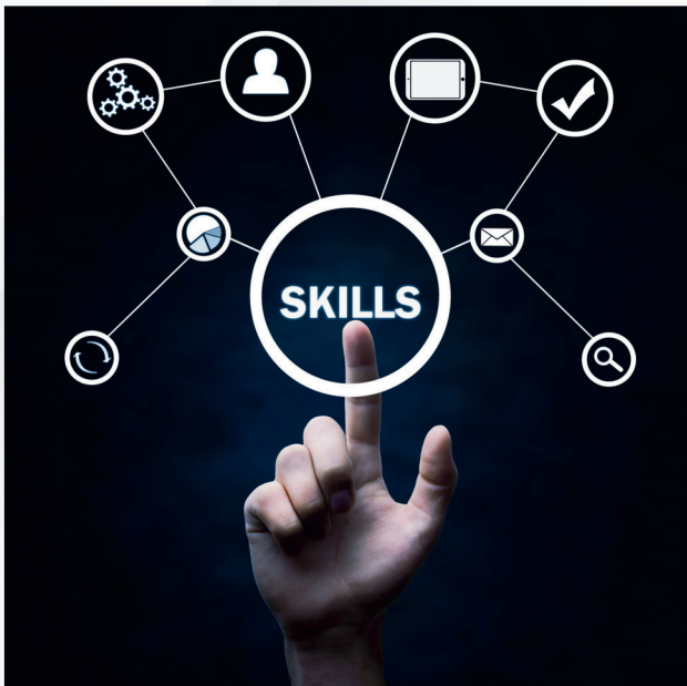
Soft skills Development